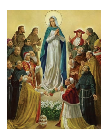
Queen of All Saints, Pray for us!

Flower Donations CWL will be collecting flower donations to decorate the church on Nov 28 & Dec 5